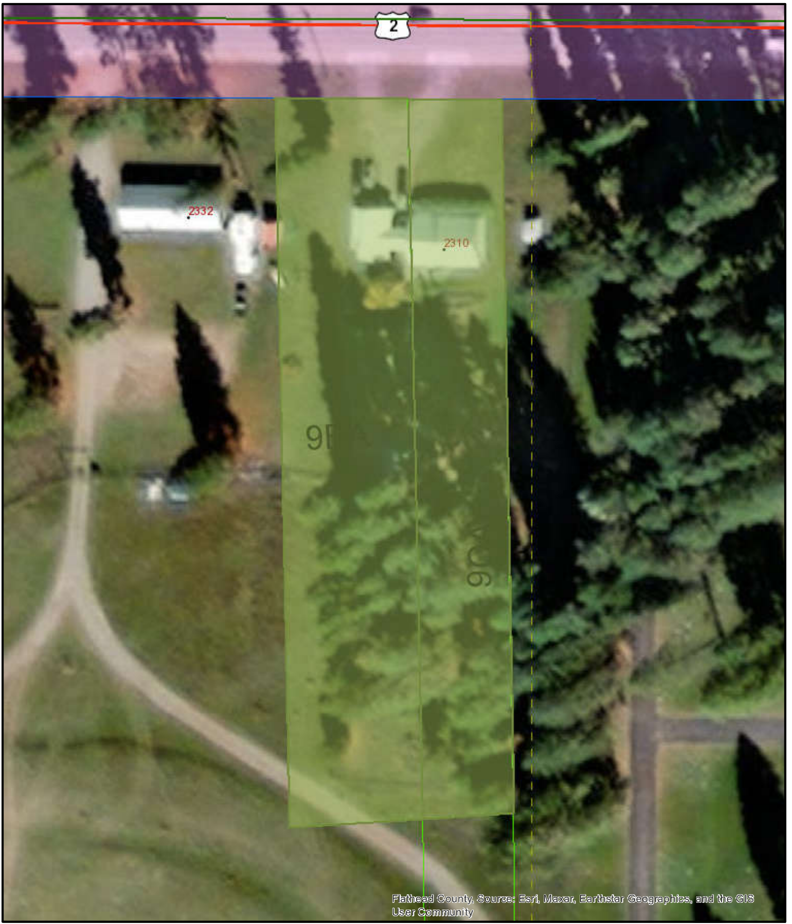
Flathead County